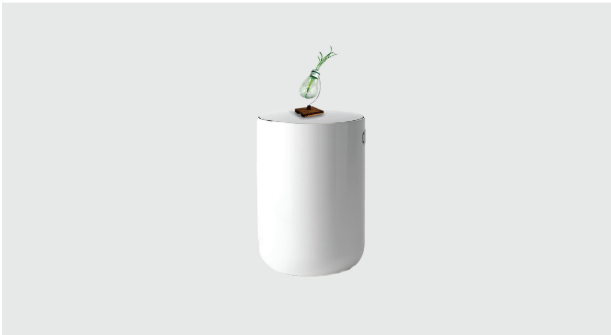
The new BotItYourself™ Waste-Recycling-Robot

The recently released BotItYourself™ recycling robot breathes new life into your waste.